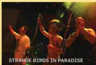
STRANGE BIRDS IN PARADISE