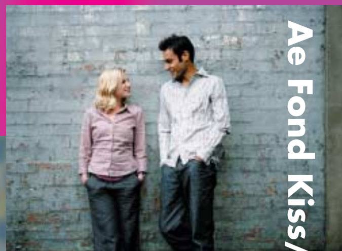
Ae Fond Kiss/Scotland