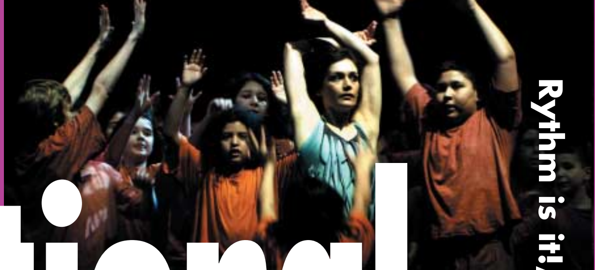
Rythm is it!/Germany