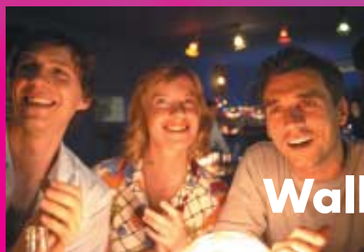
Walk on Water/Israel